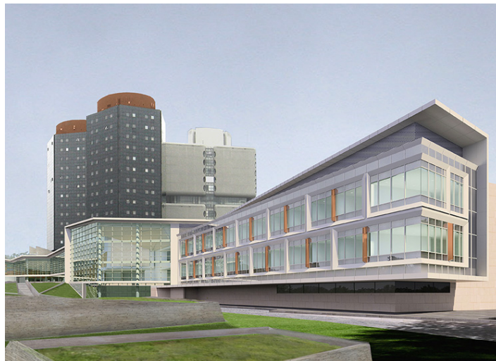
Artist's rendering of Stony Brook University Medical Center

Maintenance Schedule updated automatically