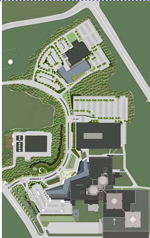
Aerial view of Stony Brook University Medical

Stony Brook University Medical Center has multiple on-going construction projects at any given time – from modernizing an entire hospital wing or renovating the